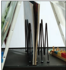
Large middle shelf with Big Book Racks