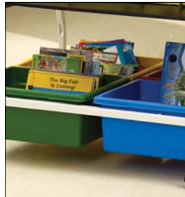
4 Sliding Open Tubs with safety stops