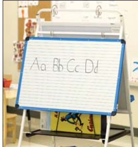
Rear removable double sided dry erase

This easel is a little more affordable compared to their cousin, the Royal® Reading Writing Center. It provides the same functionality, but with fewer bells and whistles.